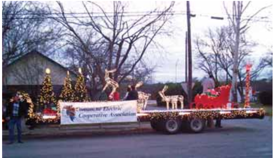
The Comanche Electric float takes part in a Christmas parade.