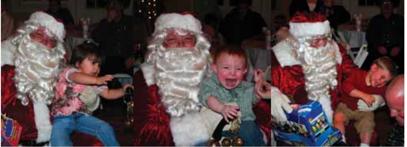
Not everyone likes Santa.