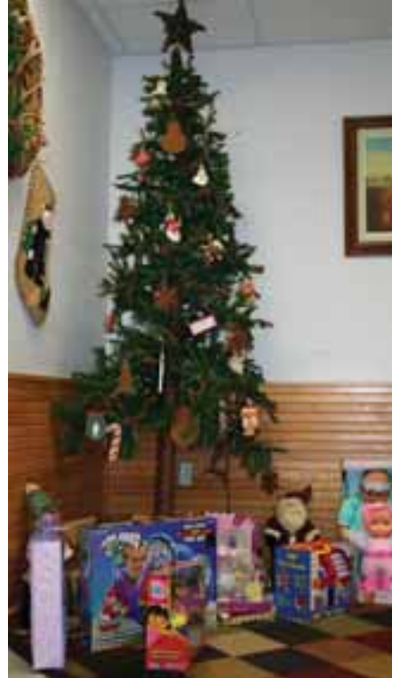
Just a few of the employee donations to Santa's Helpers.