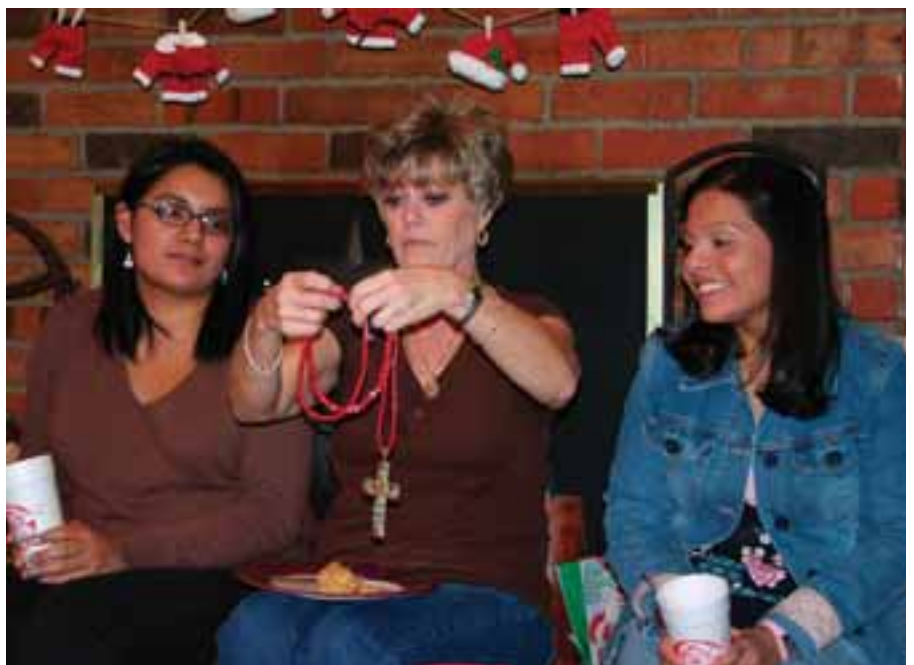
Even the big kids get into the act.