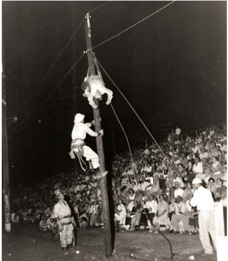
At the 1959 Annual Meeting of the Membership held at the Comanche Indian Stadium, a lineman crew demonstrates to the members how a pole-top rescue is performed.