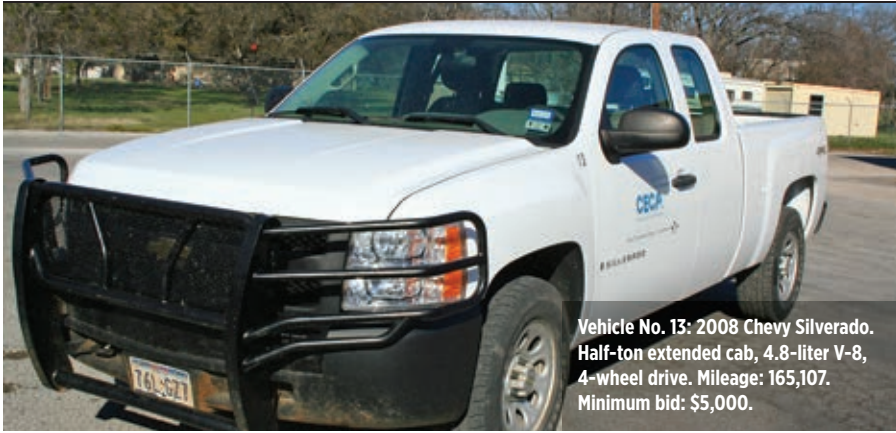
Vehicle No. 13: 2008 Chevy Silverado. Half-ton extended cab, 4.8-liter V-8, 4-wheel drive. Mileage: 165,107. Minimum bid: $5,000.