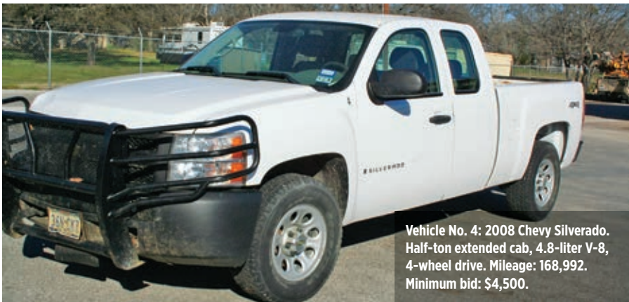
Vehicle No. 4: 2008 Chevy Silverado. Half-ton extended cab, 4.8-liter V-8, 4-wheel drive. Mileage: 168,992. Minimum bid: $4,500.