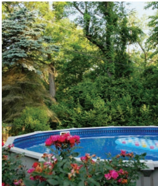
Be careful of nearby overhead lines when using long-handled tools like pool skimmers.

For more information on electrical safety, visit SafeElectricity.org .